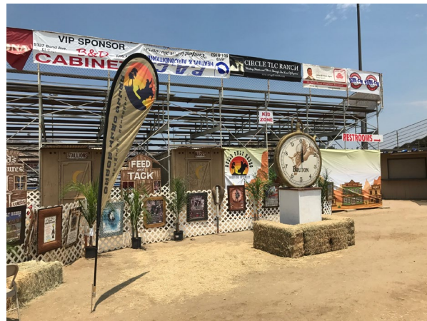
VIP / Sponsor Area

For more sponsorship information or if you have questions or comments, please call Lakeside Optimist Bulls Only Rodeo Hotline Phone number: 619-443-2447 or email: info@bullsonlyrodeo.com .